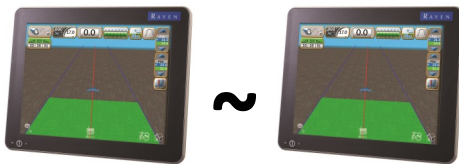
Machine to Machine Communication