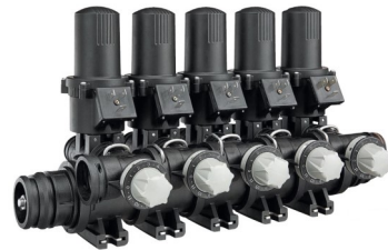
Pressure Based (manifold)